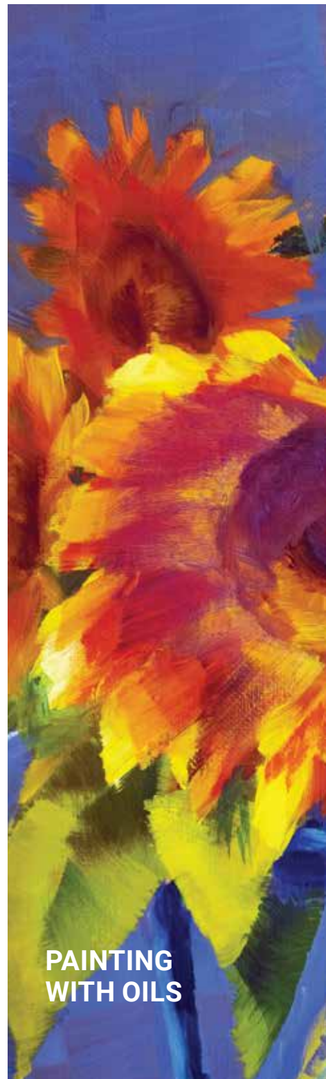
PAINTING WITH OILS