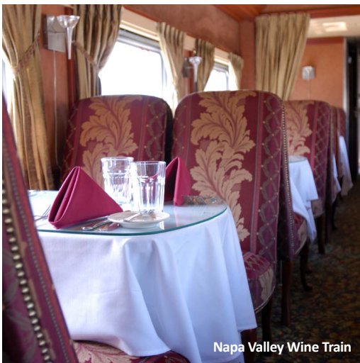
Napa Valley Wine Train