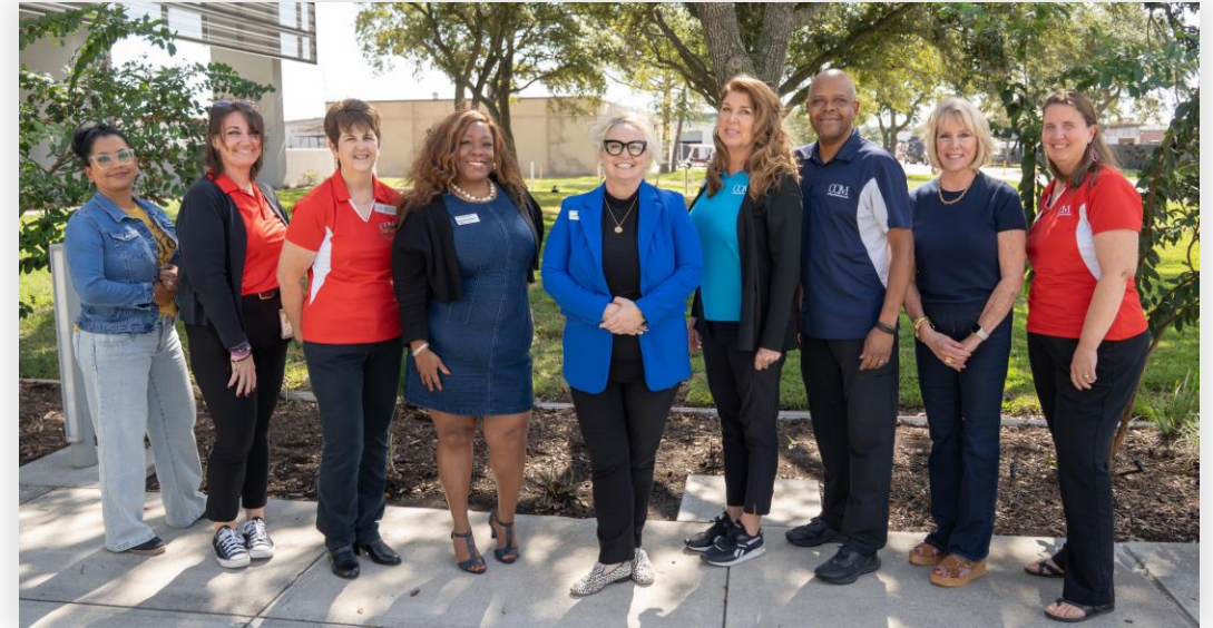
Collegiate High School Staff