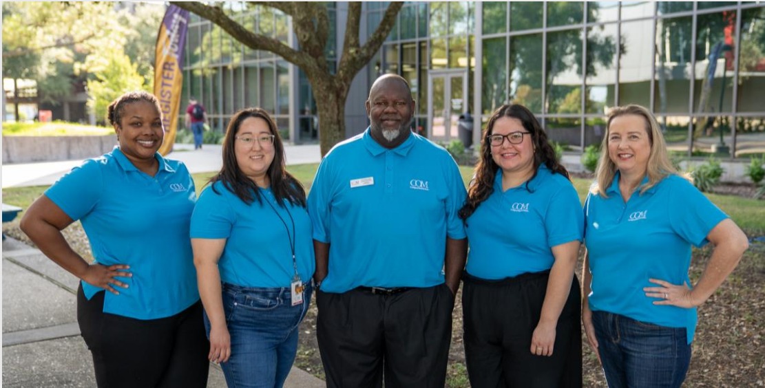
Dual Credit Staff

We are here to support you at every step!